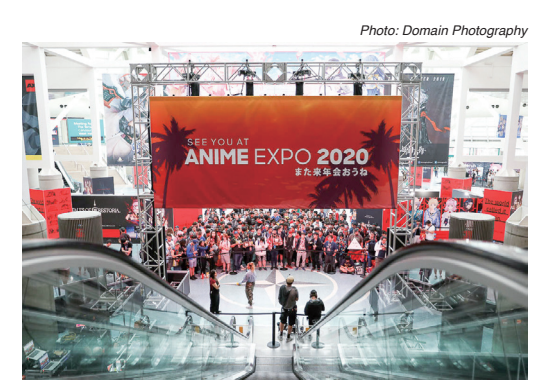
Anime conventions worldwide were canceled this year, including Anime Expo in Los Angeles, the largest in North America.

The national government's first call to prohibit all large-scale events in February caused the cancellation of AnimeJapan 2020, the industry's only official yearly trade fair. Soon after, anime conventions in the United States and elsewhere also started dropping off the calendar.