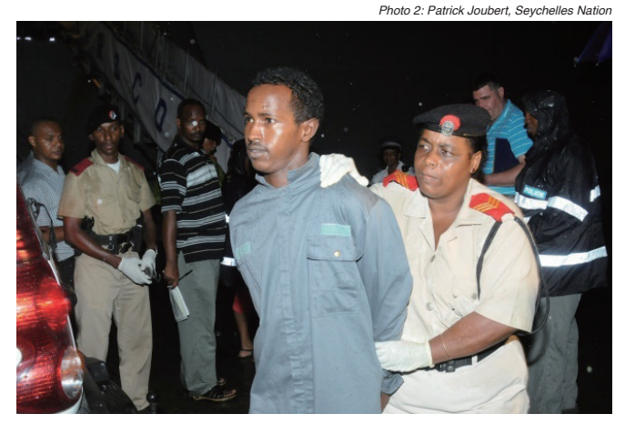
Suspected pirates apprehended by French naval ship Siroco in January 2014 are transferred to the custody of the Seychelles police.