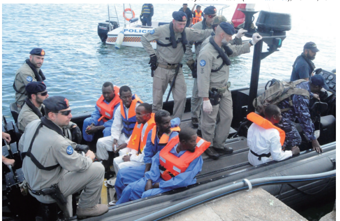
Suspected Somali pirates transferred to Seychelles