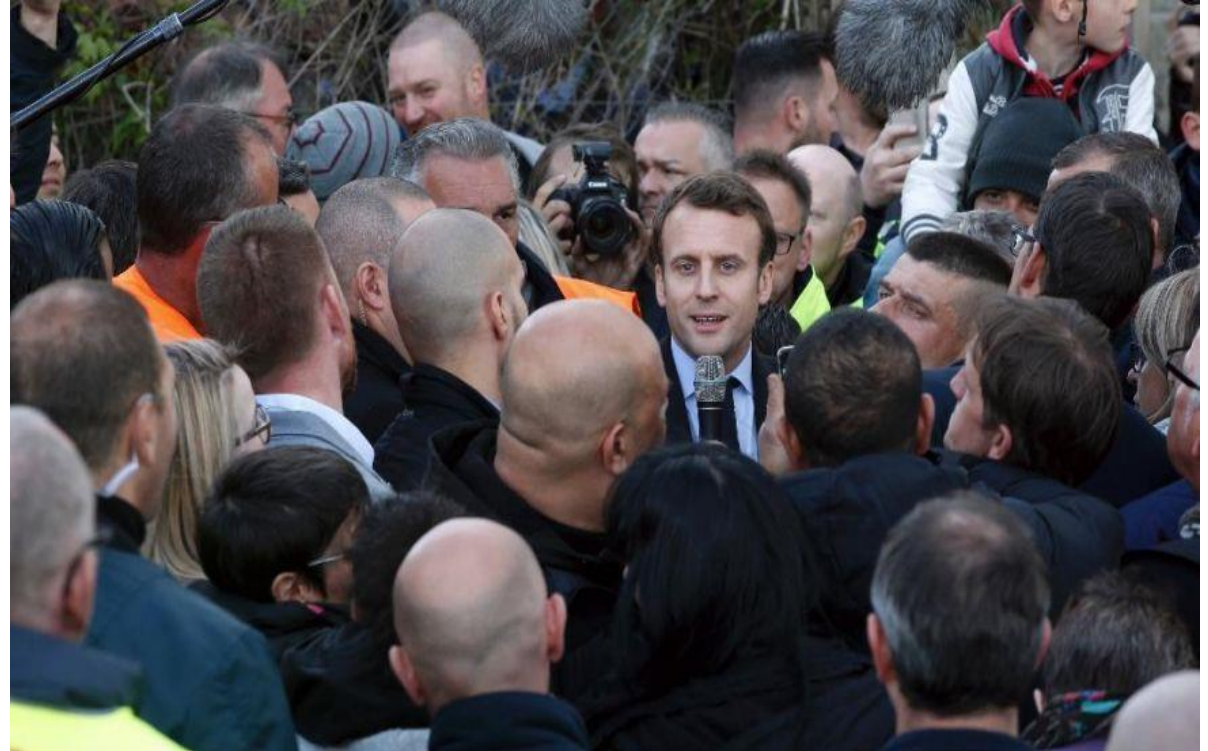
Whirlpool Factory, 26 April 2017