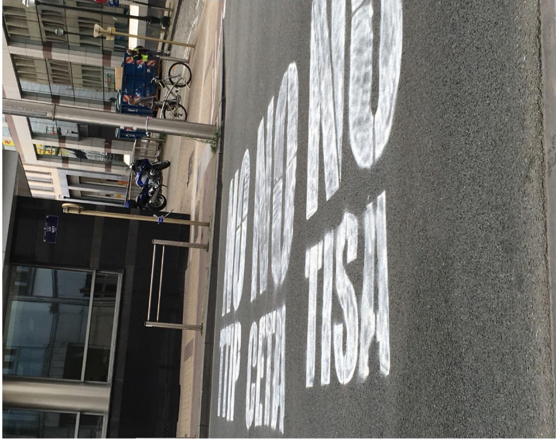
On Rue de la Loi, European Area