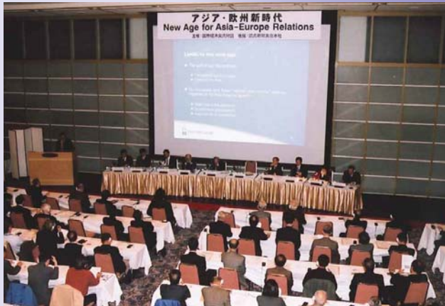
A scene from the past international symposium in 2007 organized by JEF

*For up-to-date information, please visit: http://www.congre.co.jp/japan-euforum