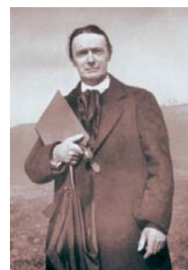
Rudolf Steiner (1861-1925)