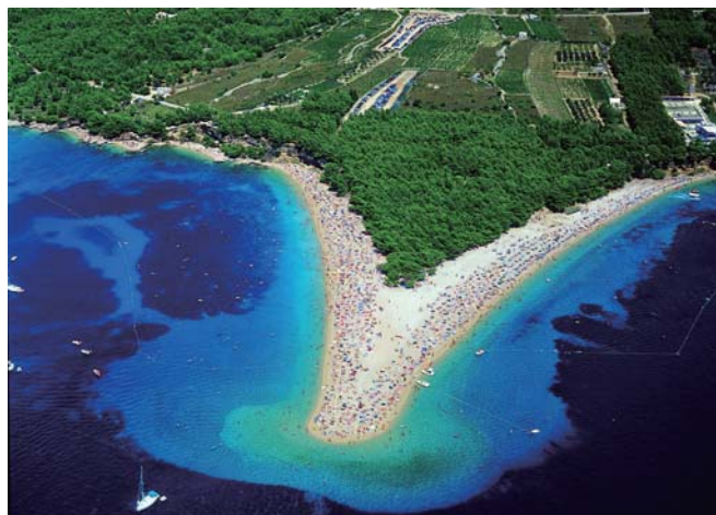
Zlatni Rat (Golden Horn), Island of Brač, Croatia: one of the world's most beautiful beaches