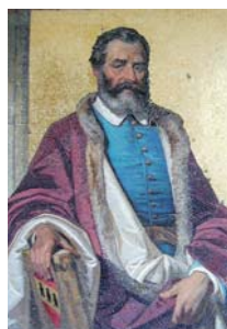
Marco Polo (1254-1324)

Japan's highly organized and harmonious attitude towards work and enterprise matches well with Croatia's individualistic and creative approach – making our two countries comfortable working together. Among Croatia's great historical figures, Nikola Tesla, called the Leonardo da Vinci of our age, left nearly 800 patents, mostly unused, even now far ahead of their time; Rudolf Steiner, the spiritual giant and the father of anthroposophy; and Marco Polo, from the Croatian island of Korcula, who traversed Euroasia. In truth, the Silk Road runs not just from Venice to Nara but from Korcula to Hiraizumi, where Marco's Golden Temple dream from his book " Il Millione " found its real place. The Croatian nation of 4.5 million people today has given the world such a number and variety of discoveries and contributions like the cravat (necktie), fountain pen, torpedo