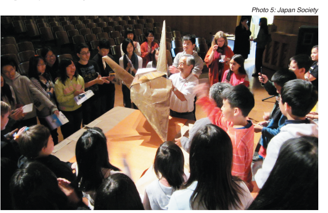
An origami class folding a big crane