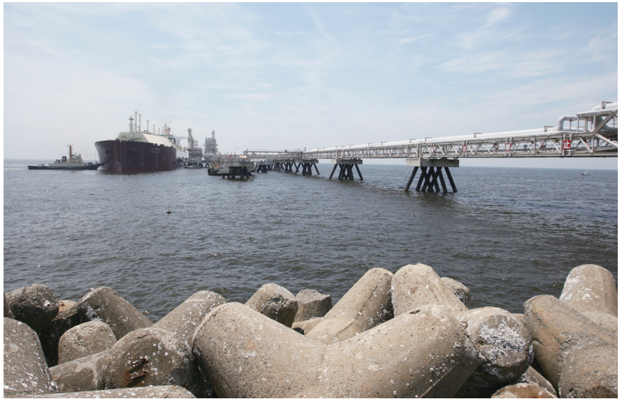
An LNG tanker owned by Qatar Gas Transport Co. arrives at Sakaisenboku port in Osaka.

system that allows reporters to dispatch news about any subject without fear of censorship. I have attended numerous news conferences and briefings and asked all kinds of probing questions to officials, and I have never been bothered by any authority here in Tokyo.