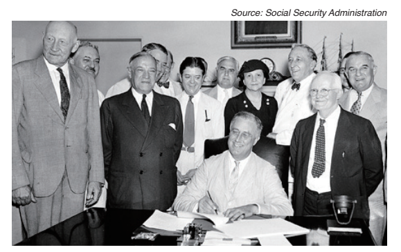
President Roosevelt signing the Social Security Act of 1935