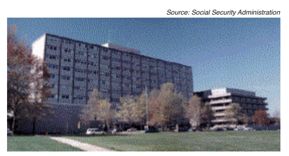
Social Security Administration Headquarters, Woodlawn, Maryland

As of early 2013, there were 57.3 million Social Security beneficiaries. Of those, 40.1 million (about 70%) were retired workers and family members, 11.0 million (19%) were disabled workers and family members, and 6.3 million (11%) were survivors of deceased workers.