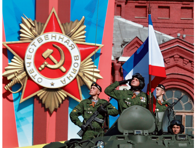
Reminiscent of the days of Soviet displays of military strength, Russian servicemen in armored vehicles salute during the Victory Day parade in Moscow's Red Square on May 9, 2014.

Italy, and militaristic Japan during the inter-war period — most of all the non-participation of some of the world's most powerful countries (e.g., the US and the Soviet Union).