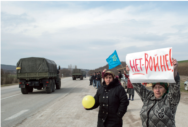
Local residents protest with a banner reading "No War!" as Russian troops move into the Crimean Peninsula at Simferopol on March 8, 2014.

international law. Except for a handful of countries, a majority of the members of the EU have recognized Kosovo's independence.