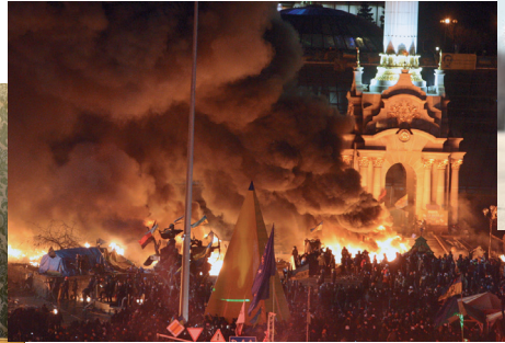
Smoke from fireworks and fires billows into the night sky as pro-Western/anti-government protesters clash with Ukrainian riot police supporting President Viktor Yanukovich in Kiev's Independence Square on Feb. 18, 2014.