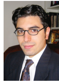
Author Constantine Pagedas