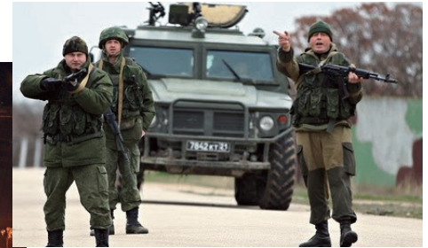
Russian troops take control of a Ukrainian base in Crimea in March 2014.