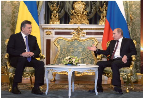
Russian President Vladimir Putin (right) & his Ukrainian counterpart Viktor Yanukovich talk during their meeting in Moscow, Dec. 17, 2013.