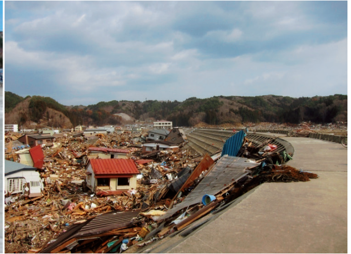
Coastal dyke in the village of Taro in Miyako, Iwate Prefecture, seen before (left) and after (right) the tsunami disaster

the legislative countermeasures are required to clearly identify the roles of different stakeholders. Disaster risk reduction is no longer just a government or community responsibility: it is the collective responsibility of society with the involvement of a wider group of stakeholders. After the Kobe earthquake, we used to talk about three types of help: “self-help”, “mutual help” and “public help”. However, after the Tohoku disaster, a further type emerged — “N-help” (N=network), which links people, communities, government and businesses.