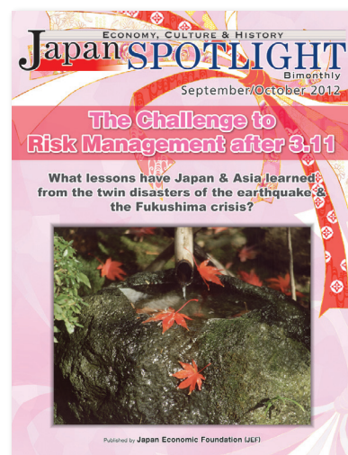
September/October 2012 The Challenge to Risk Management after 3.11

“Act like an artist. From time to time, step back. We get very involved in working on our issues and seeing them there in the document — like an artist painting a detailed tree or person on a canvas — you have to step back from time to time to see the composition in its entirety and understand the real impact of what you are making.”