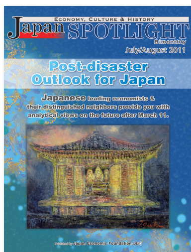
July/August 2011 Post-disaster Outlook for Japan

By presenting the issue of “ Disaster Mitigation ” this month (to be issued in Nov. 2015), we would like to remind you of our old issue of 2011-2012 highlighting the “3.11 Tohoku Disaster”. The issue discussed the impact of the earthquake in Japan on Asian companies, earthquake prevention, support from NGOs, progress reports after the incident, the Japanese economy, and risk management. You will see in the current issue that many of these topics relating to disaster mitigation are re-examined and updated.