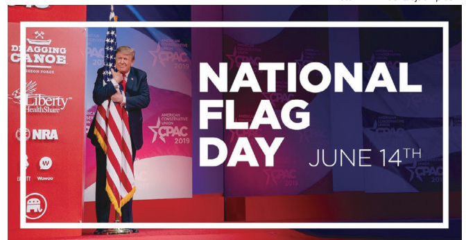
Imagery, no matter how whimsical, is critical for President Donald Trump to connect to his base. Here he is hugging the US flag on June 14, 2019 (National Flag Day) to demonstrate his patriotism.