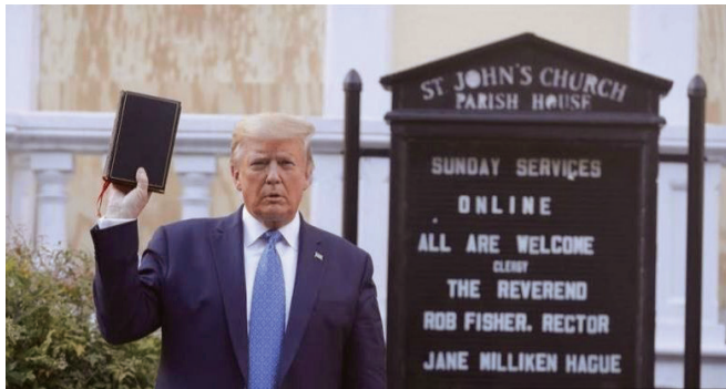
Trump's much criticized photo-op of June 1, 2020. After declaring himself the "law and order president", the administration cleared a peaceful Black Lives Matter protest near the White House in order to photograph the president holding the Bible in front of St. John's Church.

"In our schools, our newsrooms, even our corporate boardrooms, there is a new far-left fascism that demands absolute allegiance ... This left-wing cultural revolution is designed to overthrow the American Revolution. In so doing they would destroy the very civilization that rescued billions from poverty, disease, violence, and hunger, and that lifted humanity to new heights of achievement, discovery, and progress. To make this possible, they are determined to tear down every statue, symbol, and memory of our national heritage. Not on my watch."