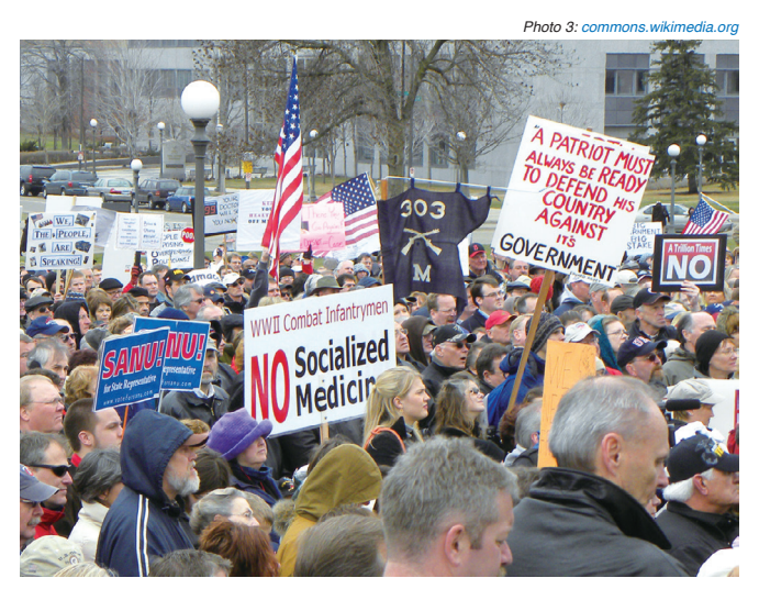
A Tea Party rally to stop the 2010 healthcare reform bill, known as Obamacare, on March 13, 2010 in St. Paul, Minnesota