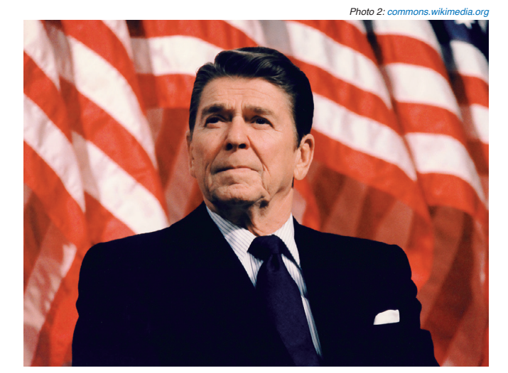
President Ronald Reagan was adept at portraying a personable, sunny image while presenting his anti-government rhetoric to the American people.

The efforts of former President Barack Obama's administration to address the 2008 global financial crisis called for the federal government to invest in the country's aging infrastructure as well as to revamp the US healthcare system. As a result, the Tea Party movement within the Republican Party formed in 2009 to resist the perception of Washington's growing power and the "Democratic Socialism" agenda under Obama. Focused on the core principles of lowering taxes, reducing the national debt and the federal budget deficit, as well as reducing the size of the federal government, dozens of Tea Party Republicans were swept to power in Congress in the 2010 midterm elections. Although the Republicans were able to cut some federal government spending through the Budget Control Act and a process known as sequestration, these actions did not realize all the major cuts the members of the Tea Party had originally envisioned. Moreover, Republicans voted no less than 64 times over the next several years to repeal one of Obama's signature pieces of legislation – the Affordable Care Act, otherwise known as Obamacare - believed by some extreme Tea Party members of Congress to put the US firmly on the road to a government-run, socialized healthcare system (Photo 3).