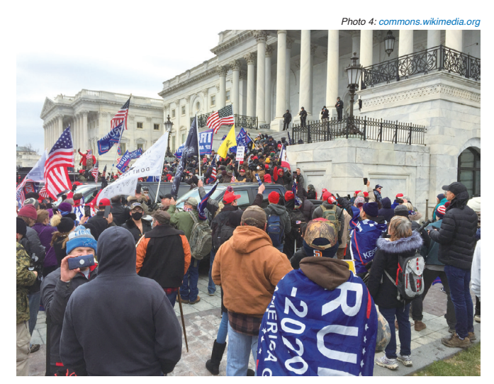
A crowd of Trump supporters marching on the US Capitol on Jan. 6 2021, ultimately leading to the building being breached and several deaths

This changed, however, on Jan. 6. Having lost the 2020 election to Biden, the Trump team made baseless claims that there had been widespread voter fraud and challenged the election results in a bid to remain in power. Trump and his associates filed 62 lawsuits contesting election processes, vote counting, and the vote certification process in nine states. These were in turn rejected by at least 86 judges at both the state and federal level, including by federal judges appointed by Trump himself, many of whom found the suits "without merit" due to a lack of evidence. Desperate to remain in power, Trump pulled out all the stops on Jan. 6 at the "Save America" rally on the Washington Ellipse organized by the far-right