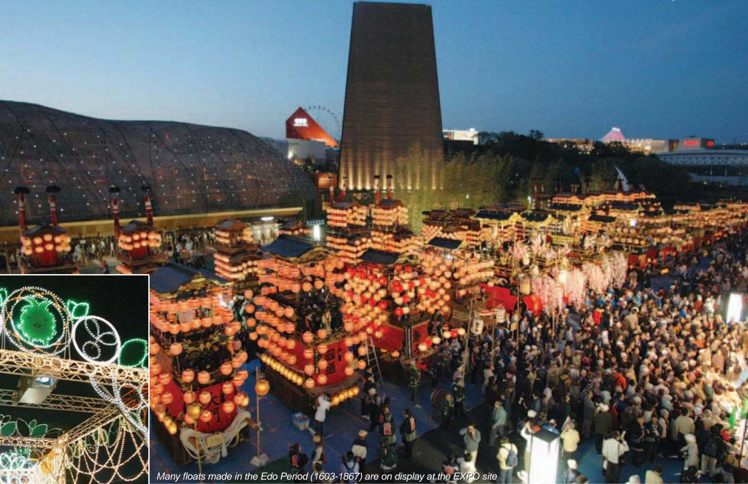
Many floats made in the Edo Period (1603-1867) are on display at the EXPO site