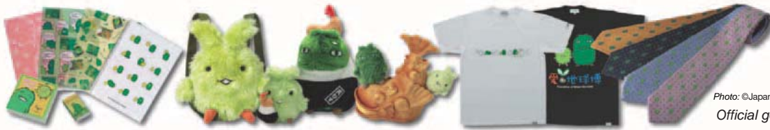
Official goods of Morizo and Kiccoro