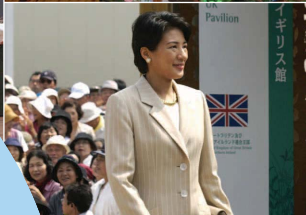
Crown Princess Masako, who is recuperating from a stress-related illness, visited the EXPO with the Crown Prince

The big and dark green one is called Morizo, the grandpa of the forests. He is a long lived Sileni. The smaller one is the child of the forest, Kiccoro. He is newly born Sileni and has a great deal of curiosity. There are lots of official goods available at EXPO 2005 from stuffed toys, cell phone straps, stationery, clothes, towels and even neck ties.