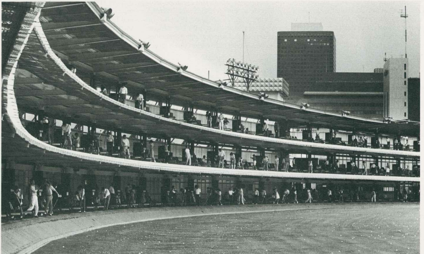
You won't see acres of golf practice ranges in Japan. Simply put, there's no room. What to do with all the golfers? Just stack 'em up.