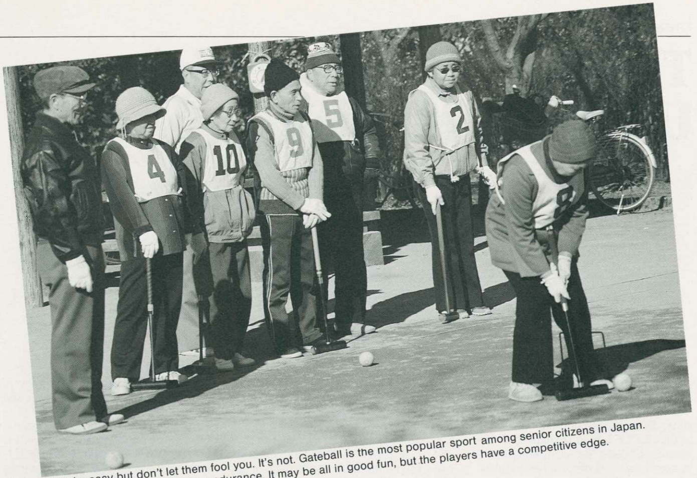
It looks easy but don't let them fool you. It's not. Gateball is the most popular sport among senior citizens in Japan. It takes a lot of skill and, yes, endurance. It may be all in good fun, but the players have a competitive edge. It keeps them fit and spectators well out of the way.