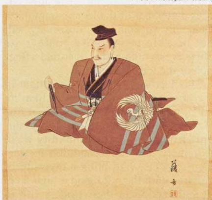
Seki Takakazu (1640/42-1708) laid down almost all the basic ideas of Wasan